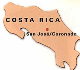
SAN JOSÉ/CORONADO - The green and sunny town of Coronado is just 10km northeast of the

Leisure Programme: Situated at the foot of a mountain, the town of Coronado offers a spectacular view across the Central Valley, and attractions nearby include a beautiful Gothic church and of course the flora and fauna of the region, from exotic birds to congo monkeys. The leisure programme includes weekly cooking and dancing lessons, rainforest tours and trips to the sandy beaches only two hours' drive away.