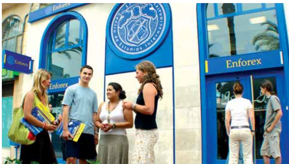
Enforex Alicante school entrance