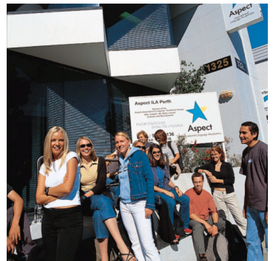
Aspect College Perth