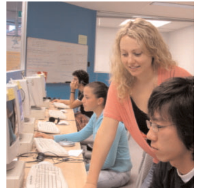
> The multimedia room at the college