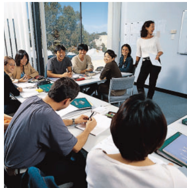
> Bright, large classrooms