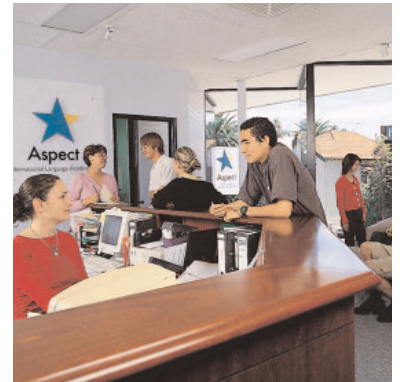
> Reception area