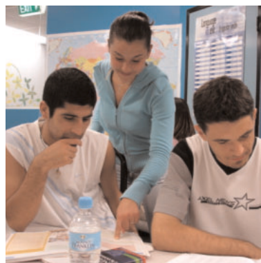
> Self-study is a vital part of learning a new language