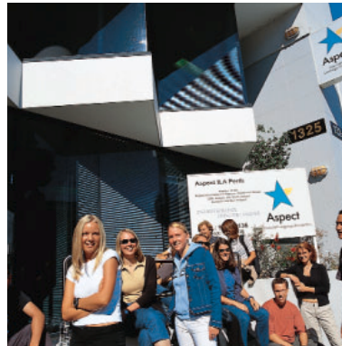
> Aspect College Perth