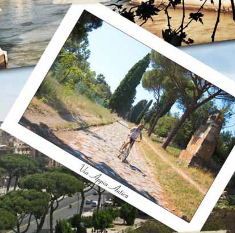
Via Appia Antica