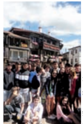
La Alberca. Plaza Mayor

AVEIRO (Portugal): we travel to our neighbour country to spend the morning visiting the old city centre of this small town known as the Portuguese Venice. During the afternoon-evening, eating at the beach, sunbathing and enjoying the sea are the plan.