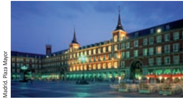
Madrid. Plaza Mayor

During the weekends we offer different excursions to different cities in Spain. We run them in collaboration with a well-known travel agency in Salamanca, so these excursions are available to Spanish students as well as to foreign ones.