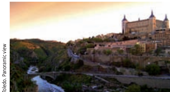
Toledo. Panoramic view

The price for these excursions varies from 40 to 50 euros per person.