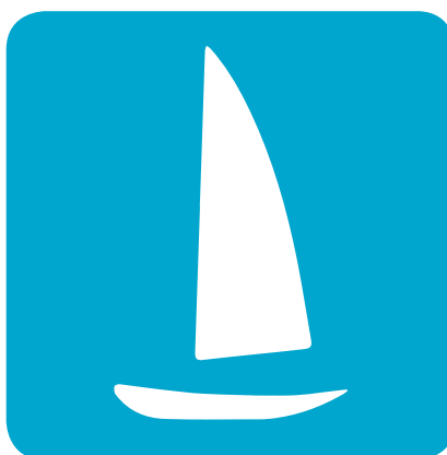
IH Palma, Mallorca