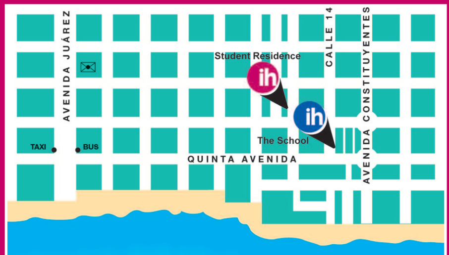
Map of Playa del Carmen