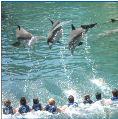
Swimming with dolphins

There are direct flights from most major cities to Cancun International Airport which is just 60 km (40 miles) north of Playa del Carmen. The journey from the airport to Playa del Carmen by bus or taxi is very affordable and should take less than 1 hour. Alternatively the school can arrange an airport meeting and transfer service on request (see details on the price list attached).