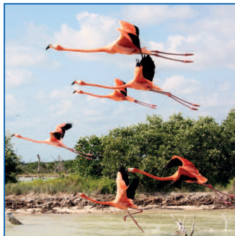
Flamingos in Río Lagartos