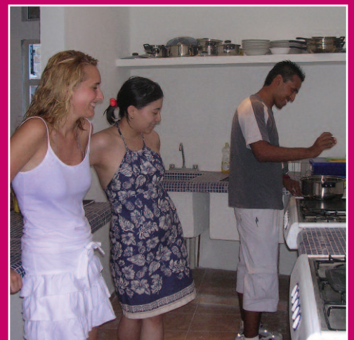
Cooking dinner in the residence