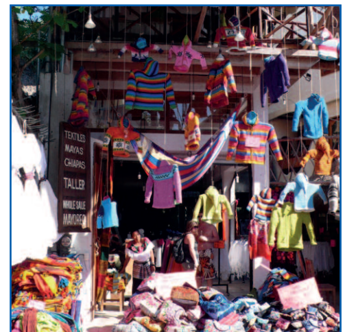
Artisan store on 5th Avenue