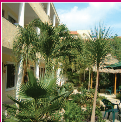
School building & garden