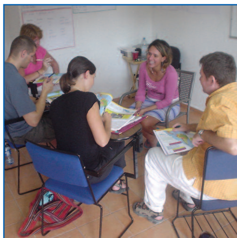
Intensive Spanish Course